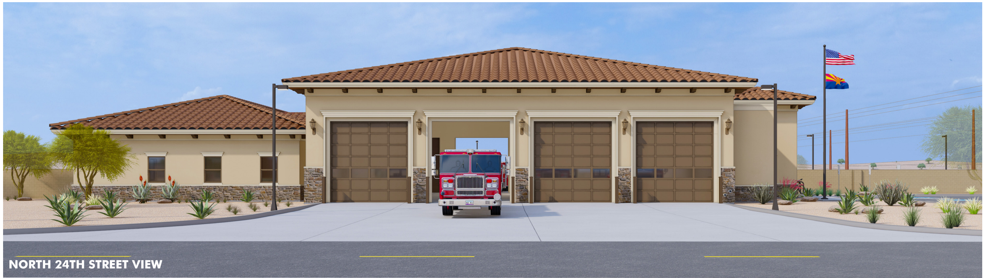
NORTH 24TH STREET VIEW