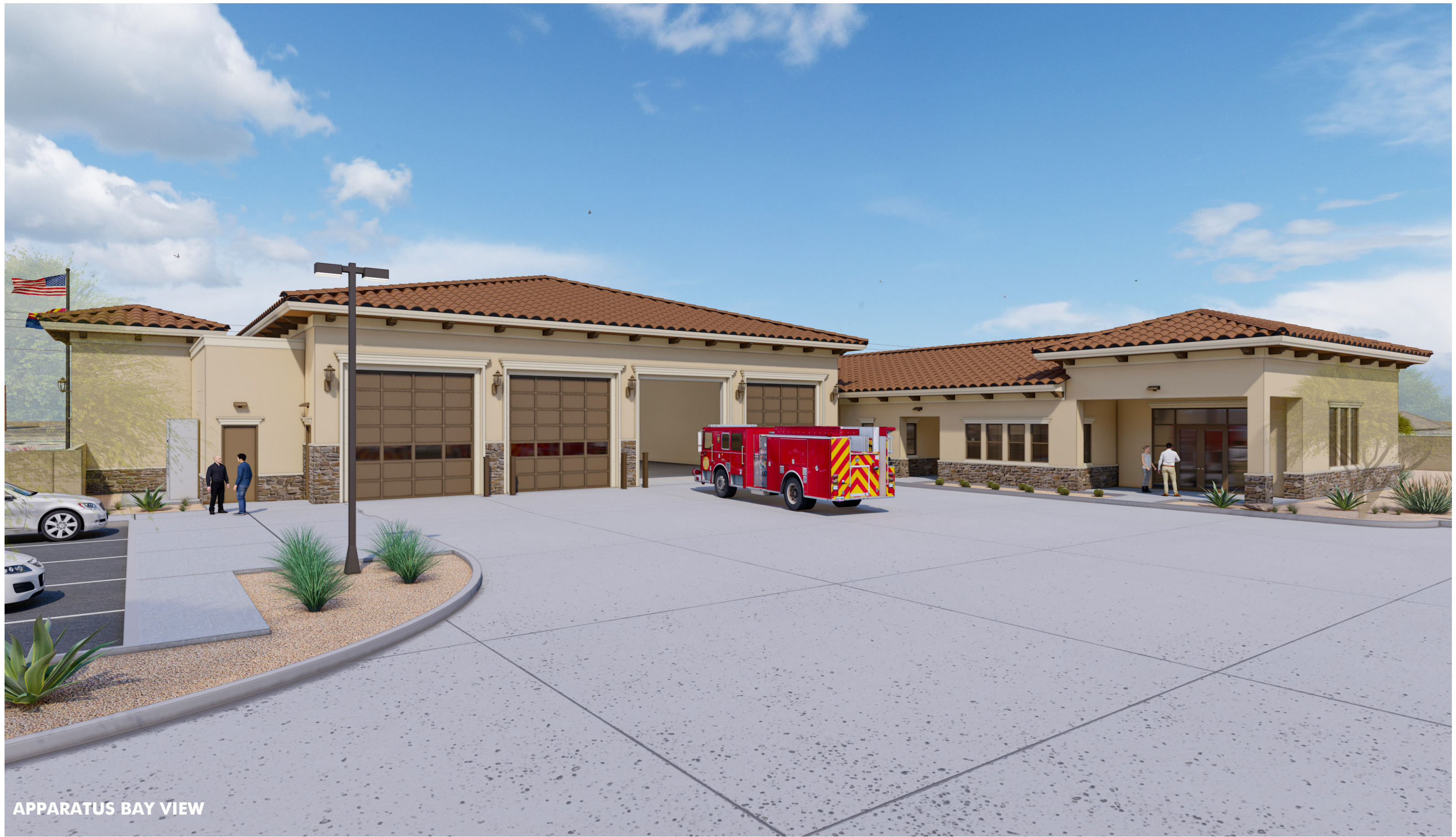
APPARATUS BAY VIEW