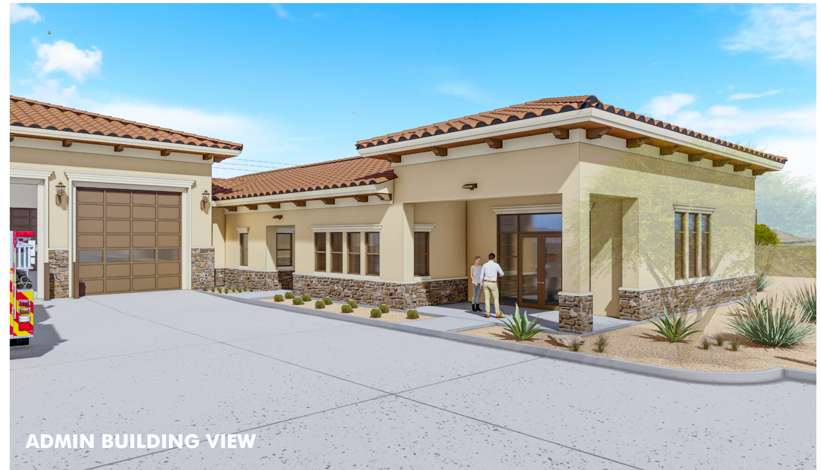
ADMIN BUILDING VIEW