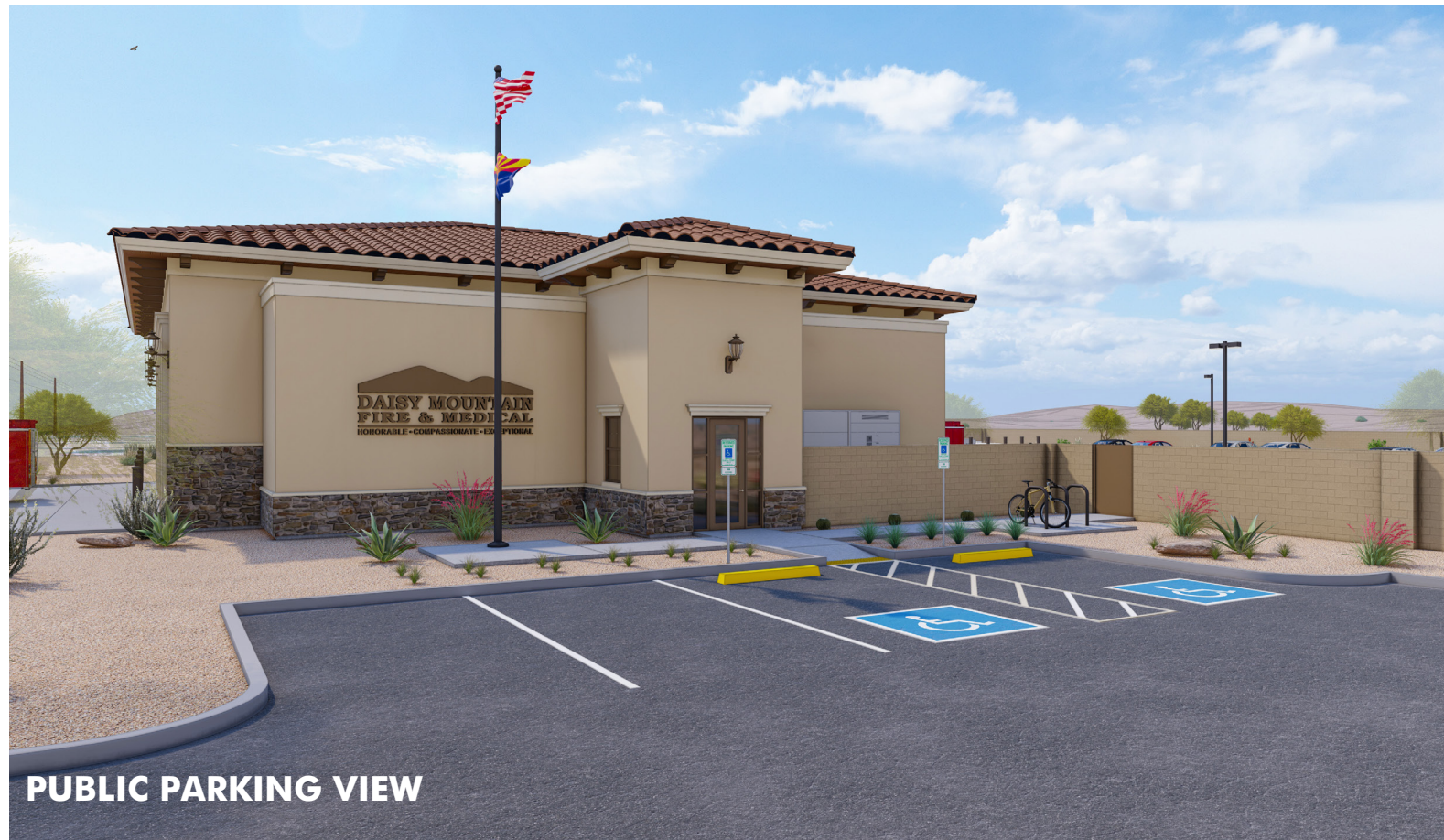
PUBLIC PARKING VIEW