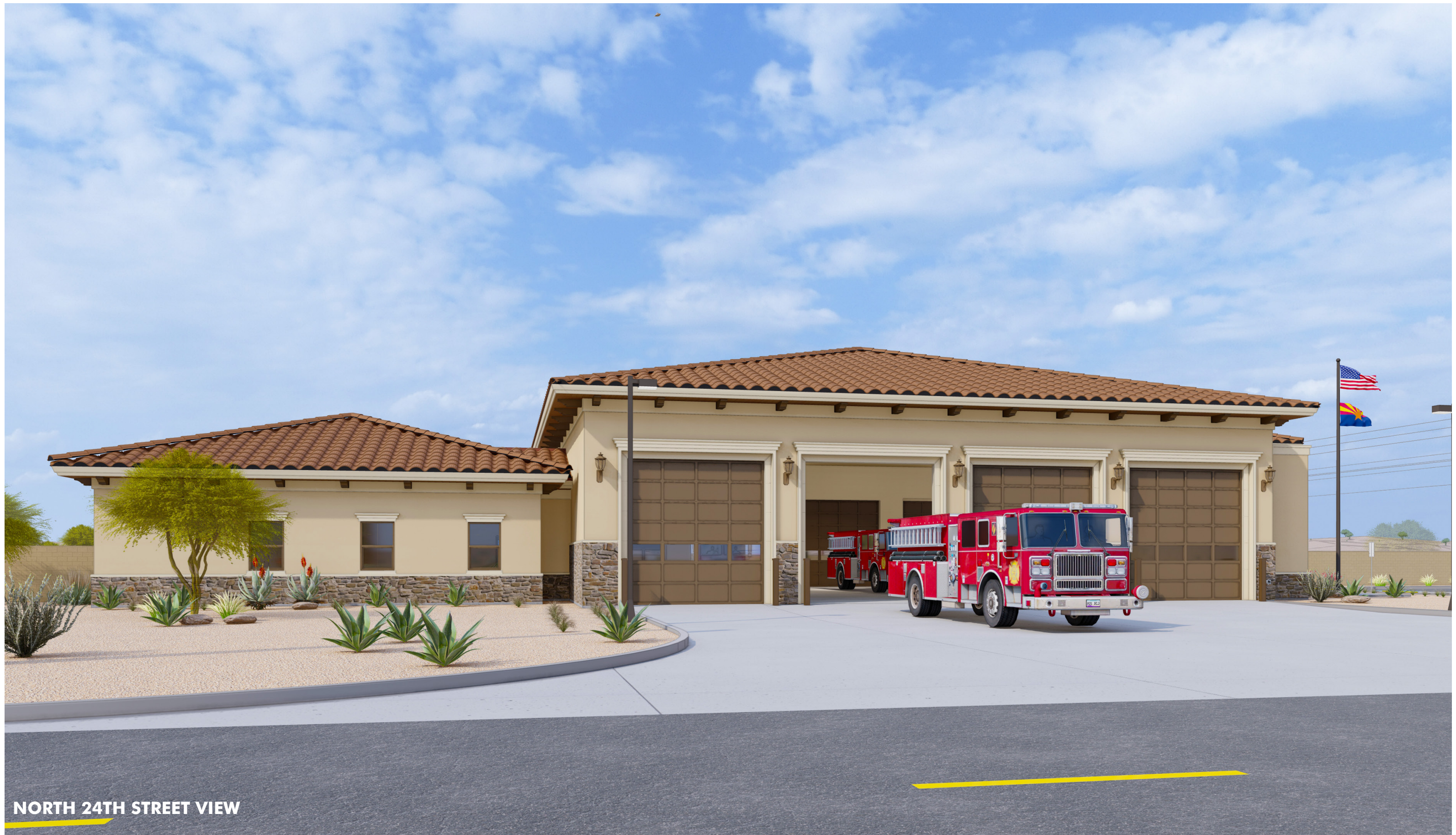
NORTH 24TH STREET VIEW